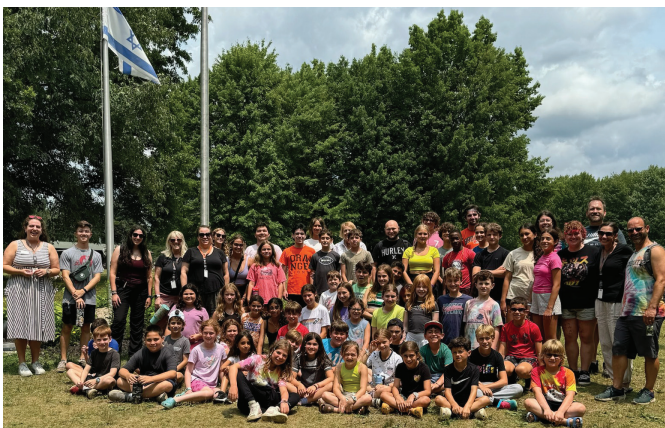
Our Mishkan Or campers at Camp Wise, and our clergy under a surprise rainbow following the first Shabbat Service at Congregation Mishkan Or!