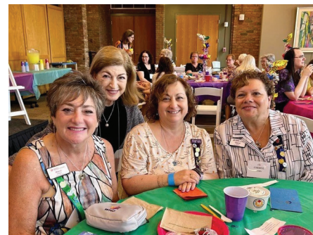
Our Women of Mishkan Or celebrated a wonderful installation weekend of events, July 12-13!