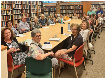
Our first Caring Community meeting with members excited to reach out to others, with in our congregation and in the community.