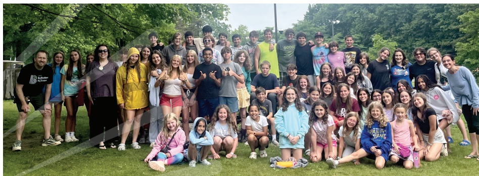
Our Limmud Team had a wonderful visit with the many, many Mishkan Or campers at a July session at Camp Wise. These young members are having a great time while they are also building memories that will last for a lifetime!