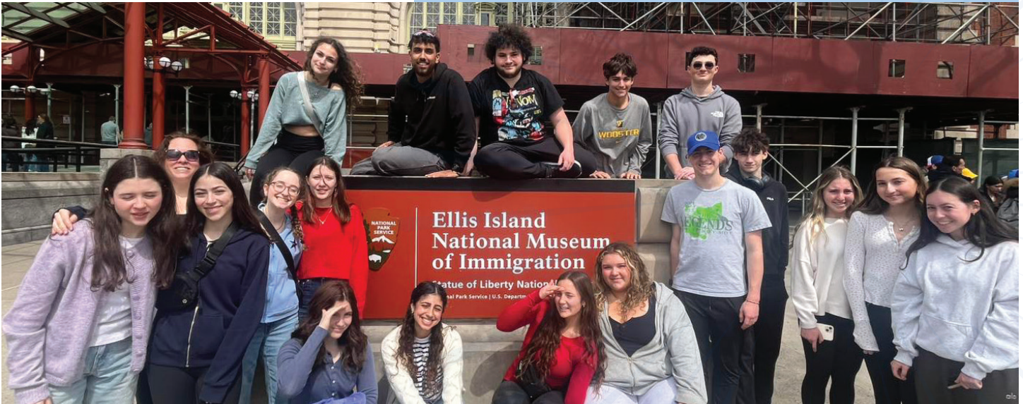
WHERE JEWISH LIFE SHINES BRIGHT - Our first class of Mishkan Or Confirmants had an amazing experience in New York City together, bonding, learning and experiencing different avenues of Jewish life.