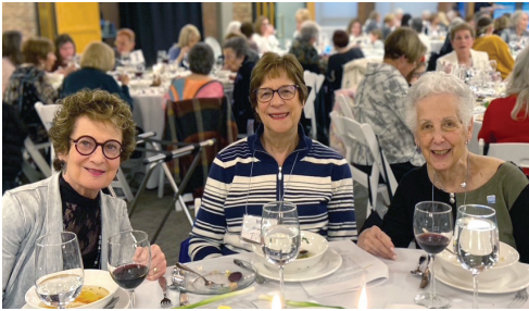
The Women of Mishkan Or's first Intergenerational Seder brought together nearly 200 members of all generations!