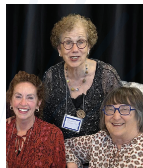
Celebrating the first year of Women of Mishkan Or!